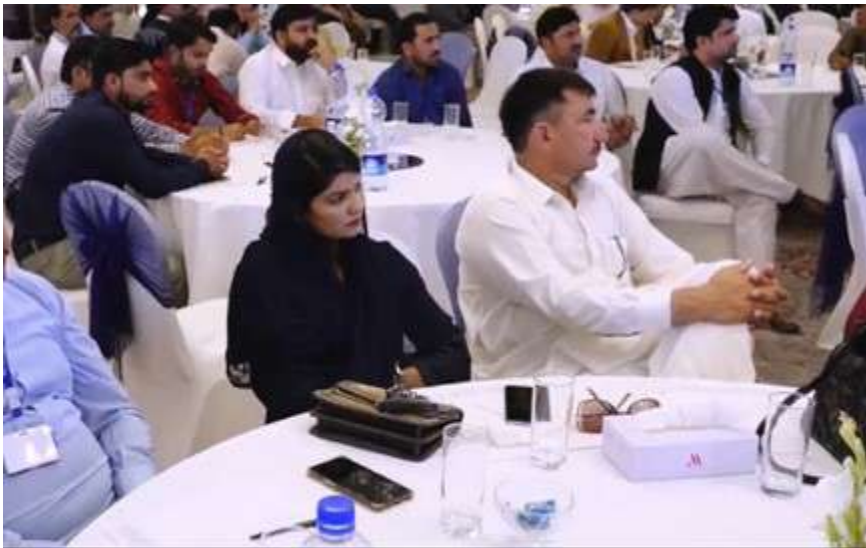
EPS participants in Citi-PPAF Award Ceremony

Seven of the best-performing clients of Khushhali Microfinance Bank (KMBL) were shortlisted to win prestigious accolades at the “14th Citi-PPAF Micro Entrepreneurship Awards – 2022”. Five of these seven shortlisted candidates, personally attended the ceremony organized by Pakistan Poverty Alleviation Fund (PPAF) and Citi Foundation in Islamabad, to recognize the achievements of successful micro-entrepreneurs across Pakistan. Environmental Protection Society (EPS) stood second in the competition with award of 0.14 million PKR.