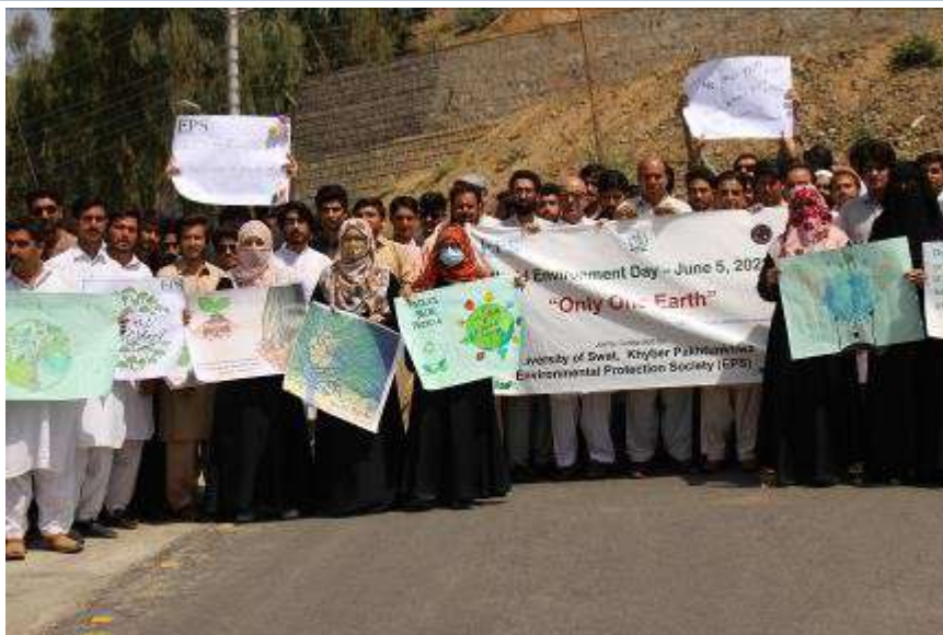
Event Participants during a walk in the University of Swat